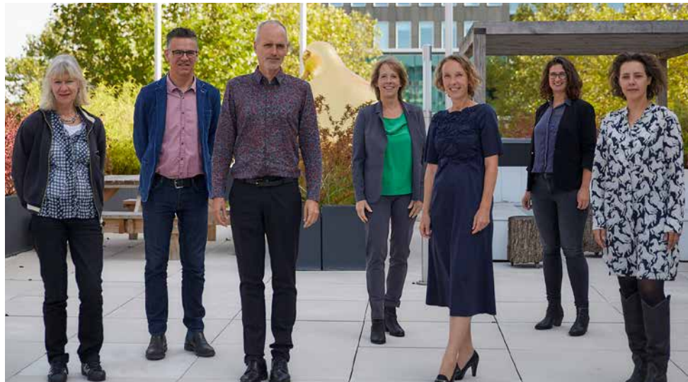
▲ Matchmaking by AM